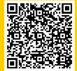
ECE – E